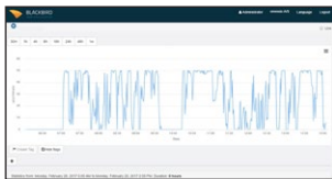
Number of units produced